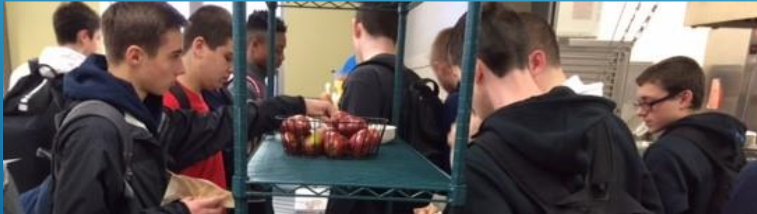
Second Chance Breakfast In Action